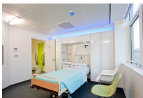
Health & Assisted Care