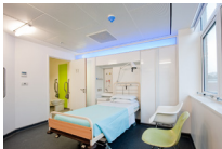
Health & Assisted Care