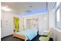
Health & Assisted Care